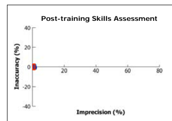
Figure 2. Post-training pipetting skills assessment, using a standardized pipetting technique.

These post-training results are shown in Figure 2 . Pipetting performance improved so significantly, that most results fell within, or very close to, the pipette manufacturer's specifications for this particular set volume of the pipette, as denoted by the red box in the figures.